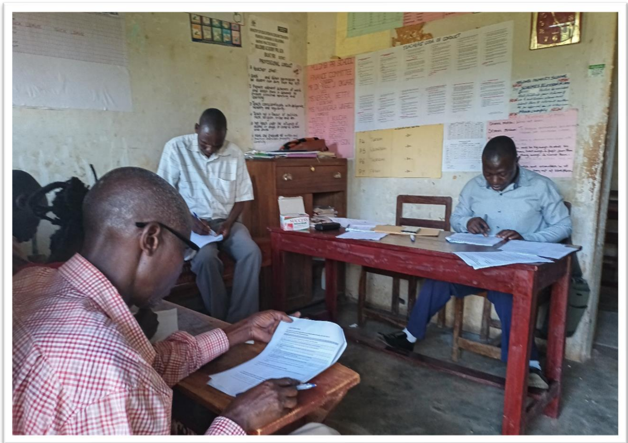
Figure 1: Teachers of Mulombi Primary School, Mutumba Sub County in Namayingo District participating in needs analysis conducted at their school by a research assistant from KAWA on 17 th October, 2023.