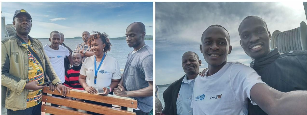
Figure 3: KAWA's research assistants for the needs analysis activity of NDDPFC on a ferry on Lake Victoria on their way to Sigulu and Lolwe Islands, Namayingo District on day two of their mission - 18th Oct 2023.