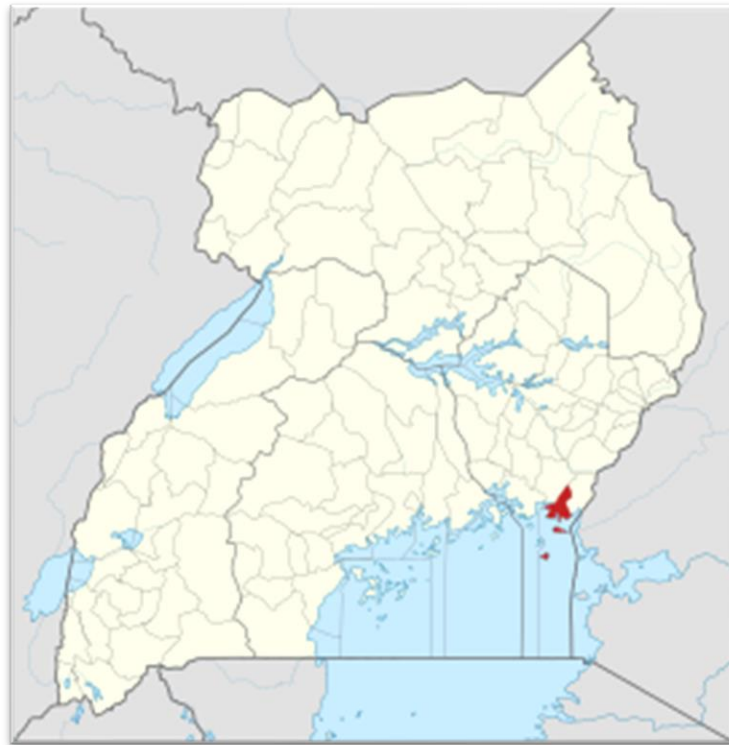
Figure 2: Map of Uganda showing location of Namayingo District (Shaded red).

This initial exercise aims at determining training needs of the teachers and viability of the participating schools for installation of IT infrastructure for the training. With the signing of a memorandum of understanding between KAWA and NDDP - FC on 10 th October 2023, KAWA's mandate for the entire pilot project was in effect and is due for completion on 31 st January 2024.